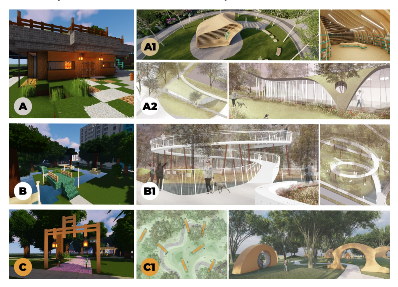
Figure 2: A comparison of the constructions created on the Minecraft server and students' designs: A - library by a Minecraft user; A1 – pavilion: library surrounded by a garden equipped with various modular benches by student Łukasz Byś; A2 - multifunctional pavilion: event space, library, cafeteria, public toilets by student Patrycja Kowalska; B - garden with a pond and bridges by a Minecraft user; B1 - multifunctional space: garden with a pond, benches, picnic area, bridge designed as a panoramic path - observation deck by student Patrycja Kowalska; C - gate by a Minecraft user; C1 - multifunctional space designed as a leisure area between artificially made hills, elements in the shape of a gate combined with different functions, such as a swing, slide, bouldering wall, and other children's playground facilities by student Ewa Nowak.