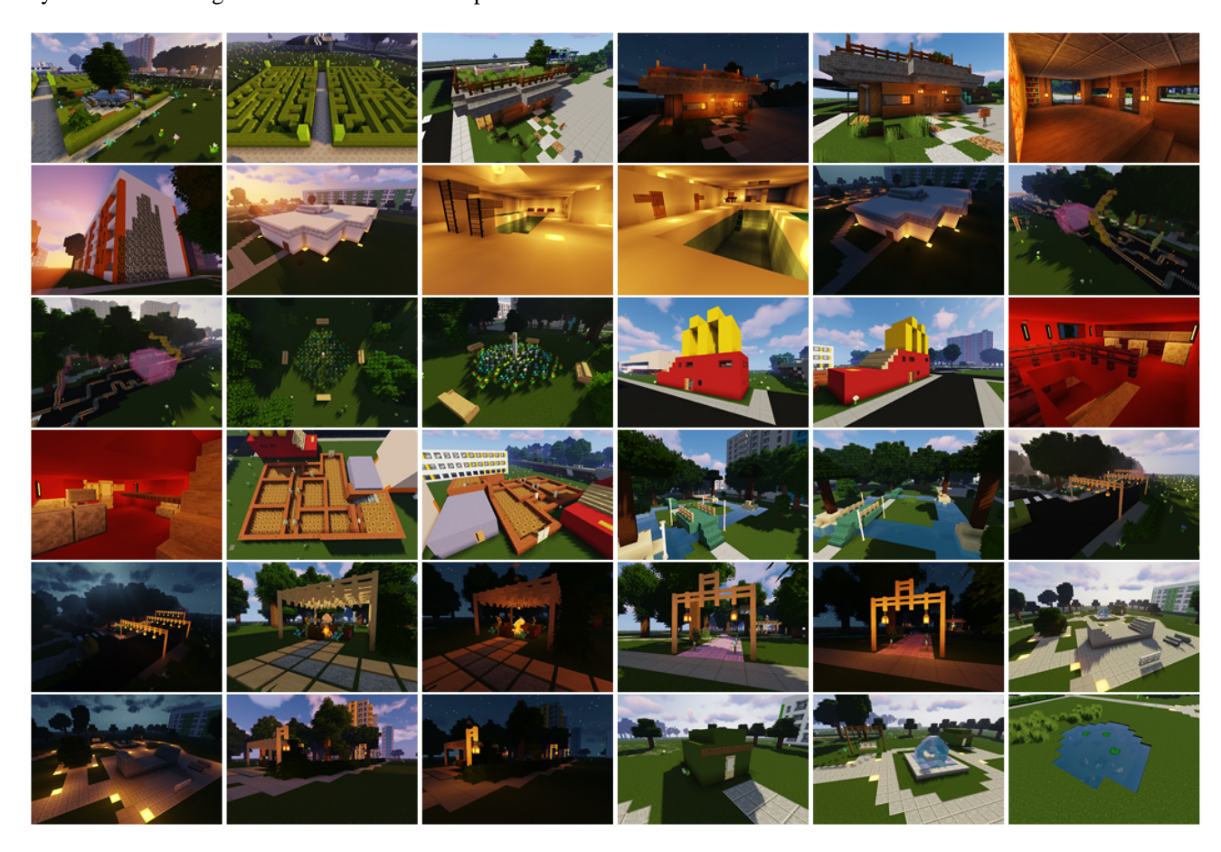
Figure 1: Examples of constructions in the future park created on the Minecraft server.

As a result of the Minecraft sessions held for 20 consecutive days, the students obtained 17 objects constructed on their server. On average, six users were building their proposals every day. Each person spent an average of about three hours on creating. The students identified five users responsible for ceaseless virtual vandalism. Despite the students' constant watch over the site to prevent destruction or removals, they were unable to record all of the proposals created by stakeholders. Figure 1 includes some examples of user constructions on the Minecraft server.